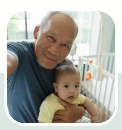
All participants receive a Certificate of Participation from SCNJ and resources